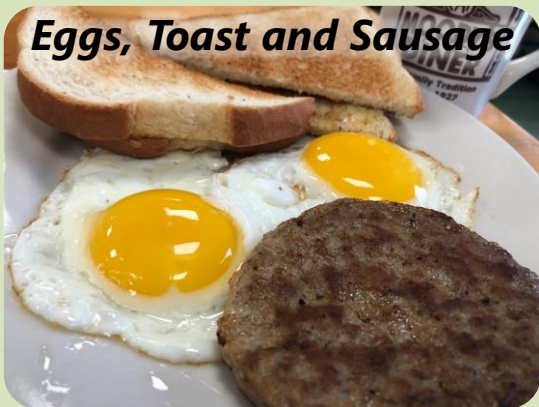
Eggs, Toast and Sausage