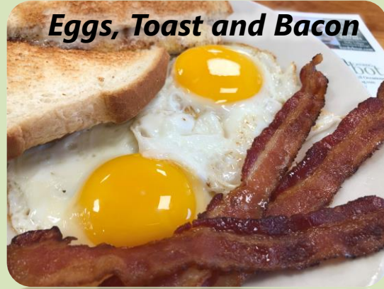
Eggs, Toast and Bacon