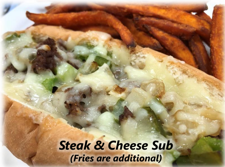
Steak & Cheese Sub (Fries are additional)

Meatball Sub - 9.99 w/ tomato sauce & cheese Steak & Cheese Sub - 11.99 w/ grilled onions & peppers Chicken Parmesan Sub - 11.99