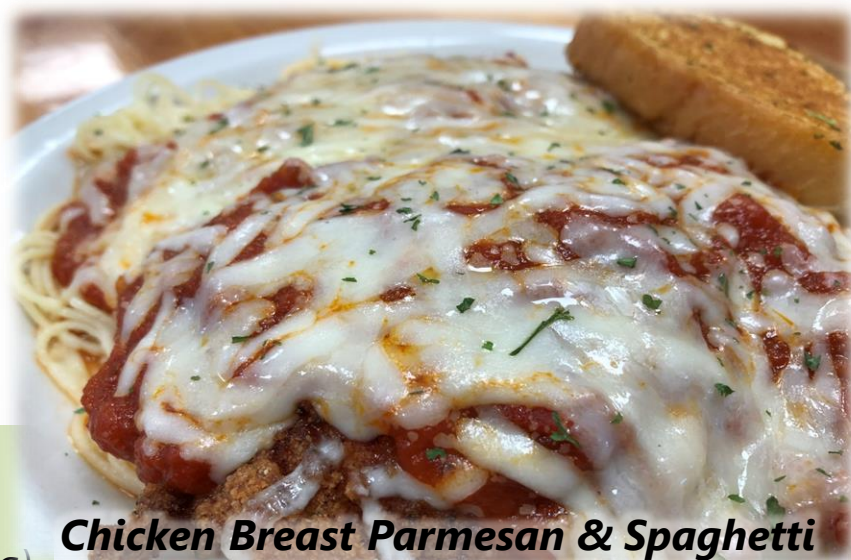
Chicken Breast Parmesan & Spaghetti

Spaghetti and Meatballs - 15.49 Spaghetti & Sauce - 13.99 Chicken Breast Parmesan & Spaghetti w/ vegetable - 16.99