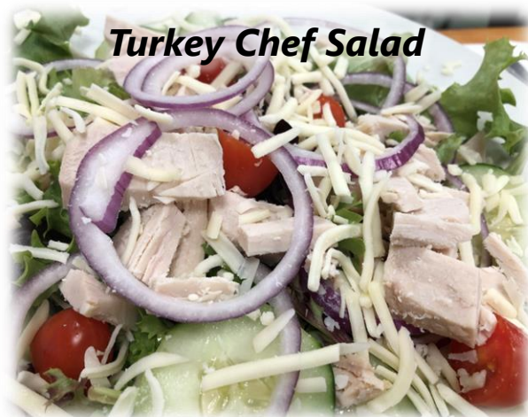
Turkey Chef Salad