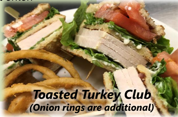
Toasted Turkey Club (Onion rings are additional)

Ham Salad - 6.49 ½ sandwich - 3.99 Egg Salad - 6.49 ½ sandwich - 3.99 Tuna Salad - 6.79 ½ sandwich - 4.29 Turkey Salad - 6.79 ½ sandwich - 4.29 Grilled Cheese - 5.49 ½ sandwich - 2.99 Pastrami & Swiss - 10.49 (on grilled Rye) Reuben (Morse's Sauerkraut, Waldoboro) - 12.49 Swiss cheese, sauerkraut, dressing on grilled rye with choice of Corned Beef, Pastrami, Turkey or Haddock Western - 5.49 Diced ham, egg & onion Toasted Turkey Club - 11.49 Made w/ our own Roasted Turkey Our Own Sliced Turkey - 8.99 w/ lettuce and mayo Fried Chicken Burger - 5.99 Ham & Cheese - 6.99 BLT - 8.49