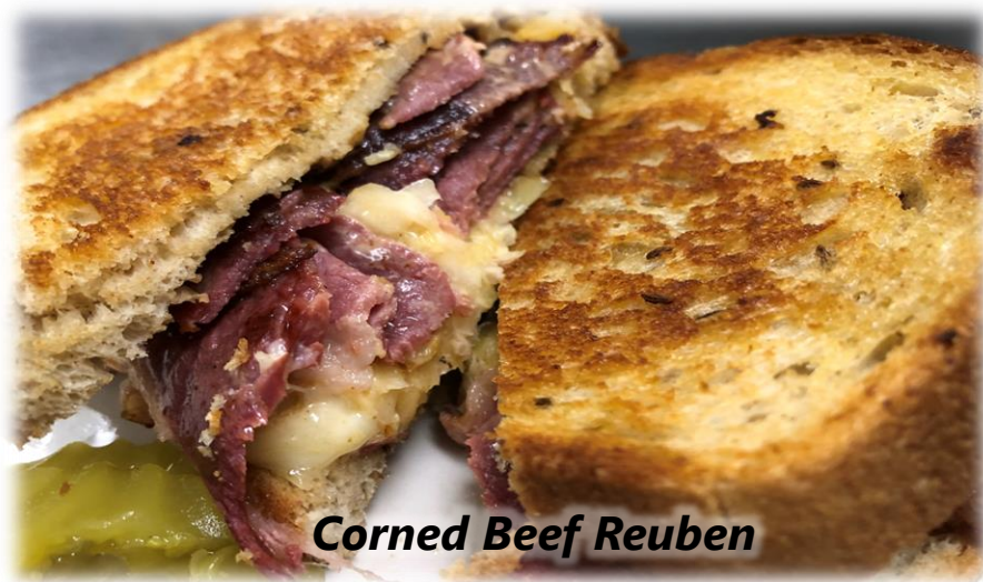
Corned Beef Reuben