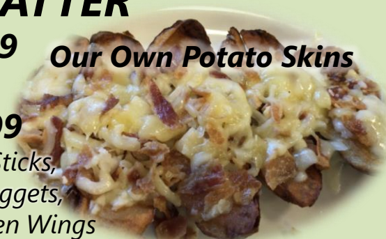
Our Own Potato Skins