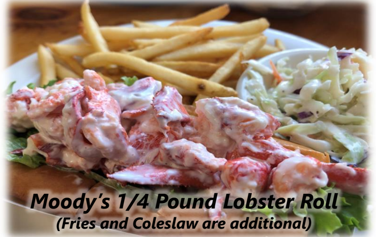
Moody's 1/4 Pound Lobster Roll (Fries and Coleslaw are additional)