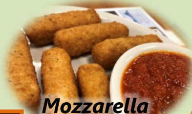
Mozzarella Cheese Sticks