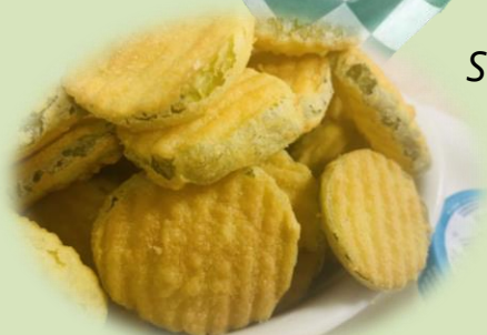
Moody's Own Fried Pickles