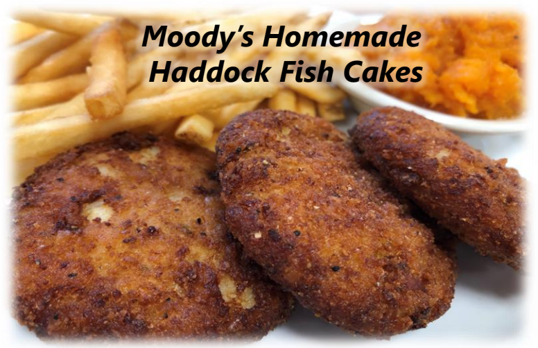
Moody's Homemade Haddock Fish Cakes

All Dinners include a potato, a vegetable, & a homemade biscuit.