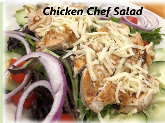
Chicken Chef Salad

Dressings: Country French, Fat-free Raspberry Vinaigrette, Lite Ranch, Moody's House Italian, Thousand Island, Parmesan Peppercorn, Balsamic Vinaigrette, or Blue Cheese